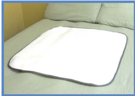
Bed Pads 30 x 34 inches white top only

Keeps skin dry even when interior layers are wet Anti-skid backing helps keep pad in place Wash and reuse up to 300 times