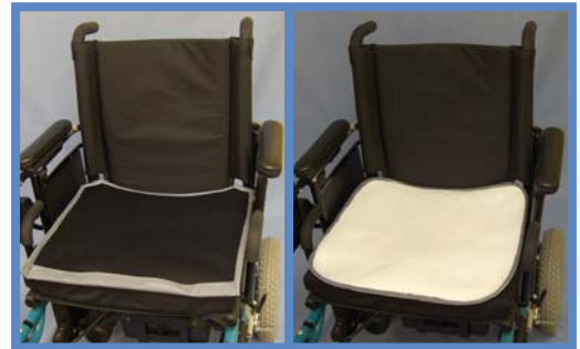
Chair Pads 17 x 15 inches black or white top